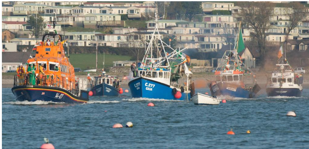
St. Patrick's Day Sea Parade

We have 274 share-holders, mostly local and semi locals but also quite a few from around the Globe who were inspired by our project and wanted to be a part of it.