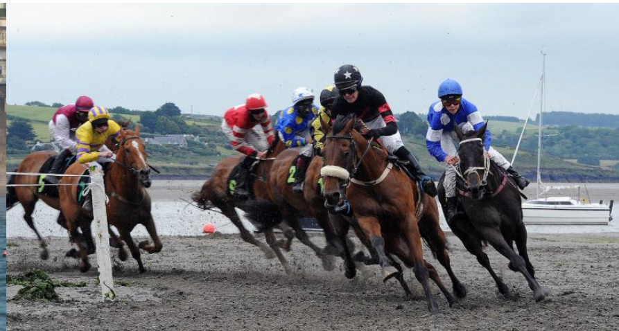
The Strand Races